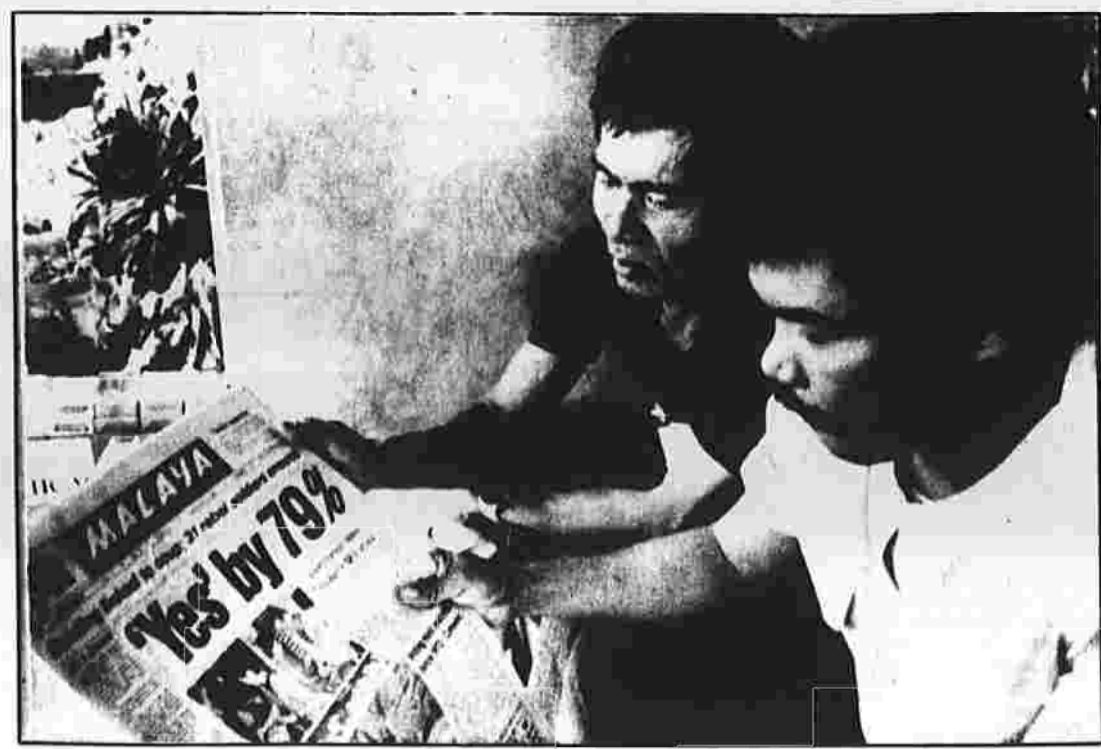
Two residents of Manila read this morning's news headlined by early results of Monday's voting on a new constitution. Early returns have voters approving the new charter by 80 percent.